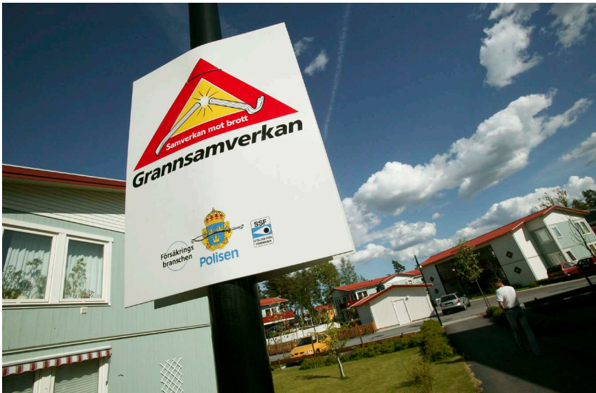
Neighbourhood watch is a type of situational crime prevention that reduces the risk of crime.