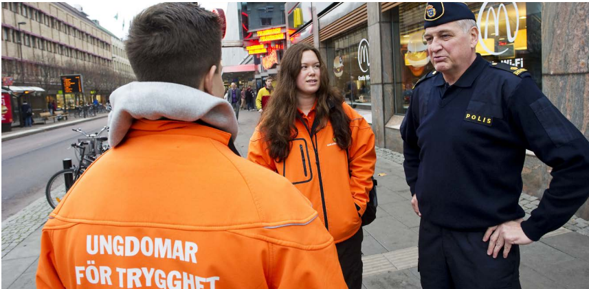
Close collaboration between the Swedish Police Authority and civil society is important for crime prevention work.

ish Police Authority has also made pledges to citizens in almost all of Sweden's municipalities. These help to increase police backing in the local community and are founded in citizen dialogues where the local community is given an opportunity to describe the problems they see as necessary to tackle. Citizen dialogues also help to engage and involve civil society in crime prevention work.