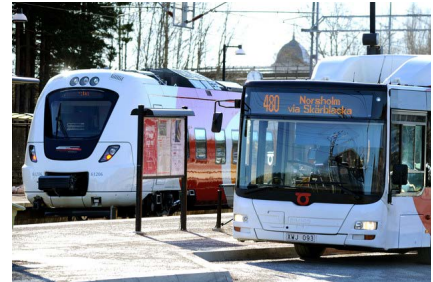
Many crimes are committed on public transport but there are also good opportunities to prevent crime.

The new Combating crime together programme brings together the Government's ambitions and objectives for crime prevention work in its different policy areas. The programme is also to help to increase awareness of crime prevention work and stimulate greater cooperation between the actors involved. Combating crime together is not, however, to be seen as the answer to all the criminal policy challenges faced by society. Many other steps also need to be taken. These include measures in criminal law and ensuring more resources for the judicial system to increase safety and reduce crime. Combating crime together complements these measures and highlights the many opportunities that exist to take preventive action against crime.