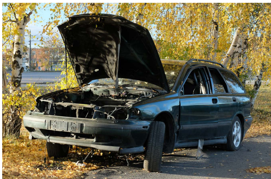
Both general welfare policy and targeted measures are needed to prevent crime.

Combating the fundamental causes of crime is largely about creating good welfare for all. This is partly a question of financial security, but also about fairly distributing chances in life and ensuring that people are able to choose their path at different phases of life on equal terms. The right to a safe childhood and a safe upbringing without drugs and violence is possibly the most pivotal factor. Later in life, the key issue is the right to education and work, and opportunities to develop and progress at work. A good residential environment, which is safe and secure, is also important. An unequal society with major social and economic injustices may form a breeding ground for crime. In